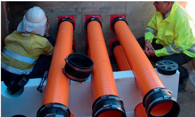
Installation of Hateflex flexible conduits to wall inserts.