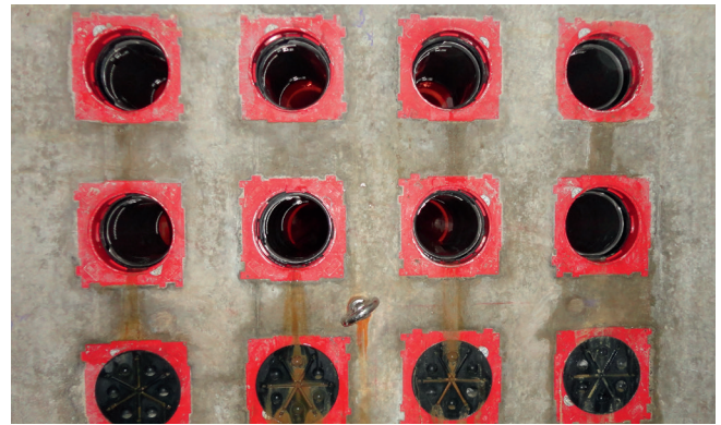
HSI 150-K2 after concreting casement.