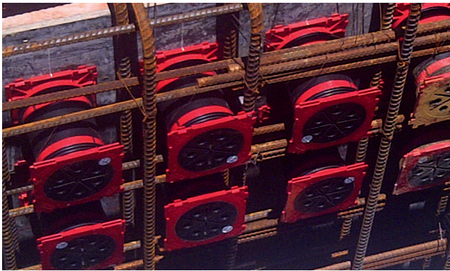
HSI 150-K2 wall inserts, installed in the formwork.