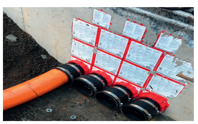
Connection of Hateflex spiral hose using KES 150-D system cover