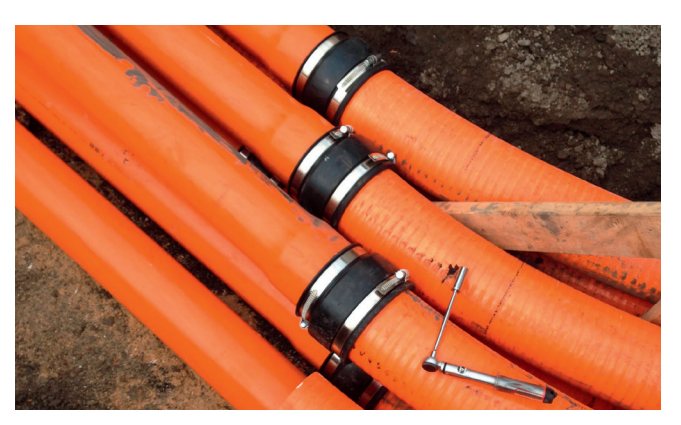
Connection sleeves between rigid and Hateflex spiral hose