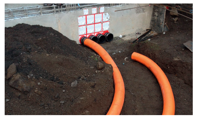
Hateflex spiral hose 5.3 m lengths