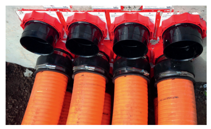
Connection of Hateflex spiral hose using KES 150-D system cover